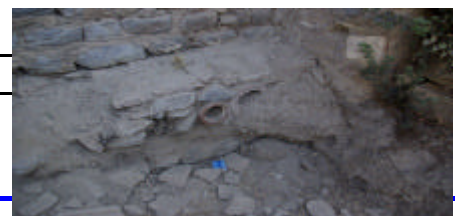
The double pipes system

Once we left the upper city we headed down a steep path on the side of a mountain. In the middle of the path stood a metal ring where the Torch used to be attached to the ground. This was a primitive lighthouse using olive oil as fuel. The light was not allowed to go out and it was used to guide the ships up the estuary to port. Christians who travelled this main path would pass by this torch frequently. So words such as John recorded to the angel of the church in Ephesus, in Revelation 2:6, "Repent and do the works you did at first. If not, I will come to you and remove your lampstand from its place" would be a poignant reminder to the Ephesian believers to persevere.