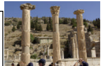
Ephesus experienced many earthquakes. Apparently the city architects weren’t fussy about whether they replaced the columns in a traditional Roman or Greek style

However after reading Ephesians, visiting the site and reading Ephesians again over some weeks, I am stunned by the connections between the text and the geographical site of Ephesus. In any case understanding first century Ephesus helps us to understand the culture and context of the Greco- Roman world in which Paul was ministering, and writing. 90% of the architecture we see in Ephesus today is Roman, whereas some other ancient cities in Turkey are strongly Greek.