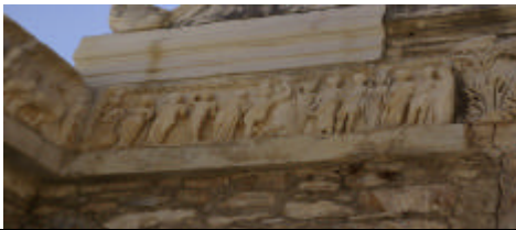
Amazon warriors with shields and weapons are depicted on this temple