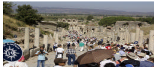
Sloping path joining the upper city to the residential. Celsus library in middle background and silted estuary now farmlands the background before the hills..

Paul chose to use financial language on purpose because the temple of Artemis was also a bank. Coins were minted there and credit given and a type of banking carried out (Turizm 1998). If a new Christian could not invest their money in the temple of Artemis, to gain favour from her, and avoid her judgement on their crops etc, what were they to do? Paul suggests they needed to focus on the opposite financial transaction. The true God wants to invest into the person. God puts a deposit into the person, called the Holy Spirit, who is a guarantee that the new believer will not suffer God's judgement. So the Ephesus Christian could plant their crop and grow their herds without fear of judgement of the gods.