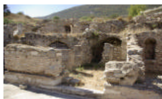
Small, well placed bricks make up the walls and archways of Ephesus side street

A typical Ephesus house had rooms built around a courtyard. The rooms had no windows but were open to the courtyard which had no roof. Hence the sun, wind and rain had access to the middle of the home. The floors were covered in mosaics and the walls had fresco paintings.