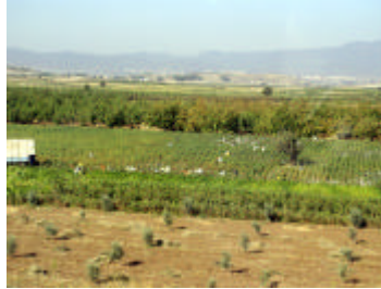
Local Turks hand harvesting cotton with olive trees in foreground and fruit trees in background

Six weeks ago I found myself on a coach travelling through apricot and olive groves, past local workers hand picking cotton, and village women wearing traditional Muslim headscarves. No I was not on holiday in Tuscany, I was on my way to the ancient ruins of Ephesus, in modern day Turkey.